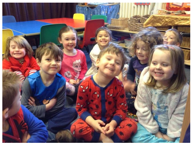
Arriving in our pyjamas.