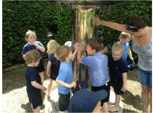
This was the favourite although some of us took a while to be brave enough to go through the jets.