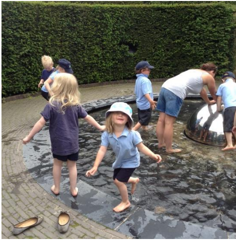
Then onto the water features.