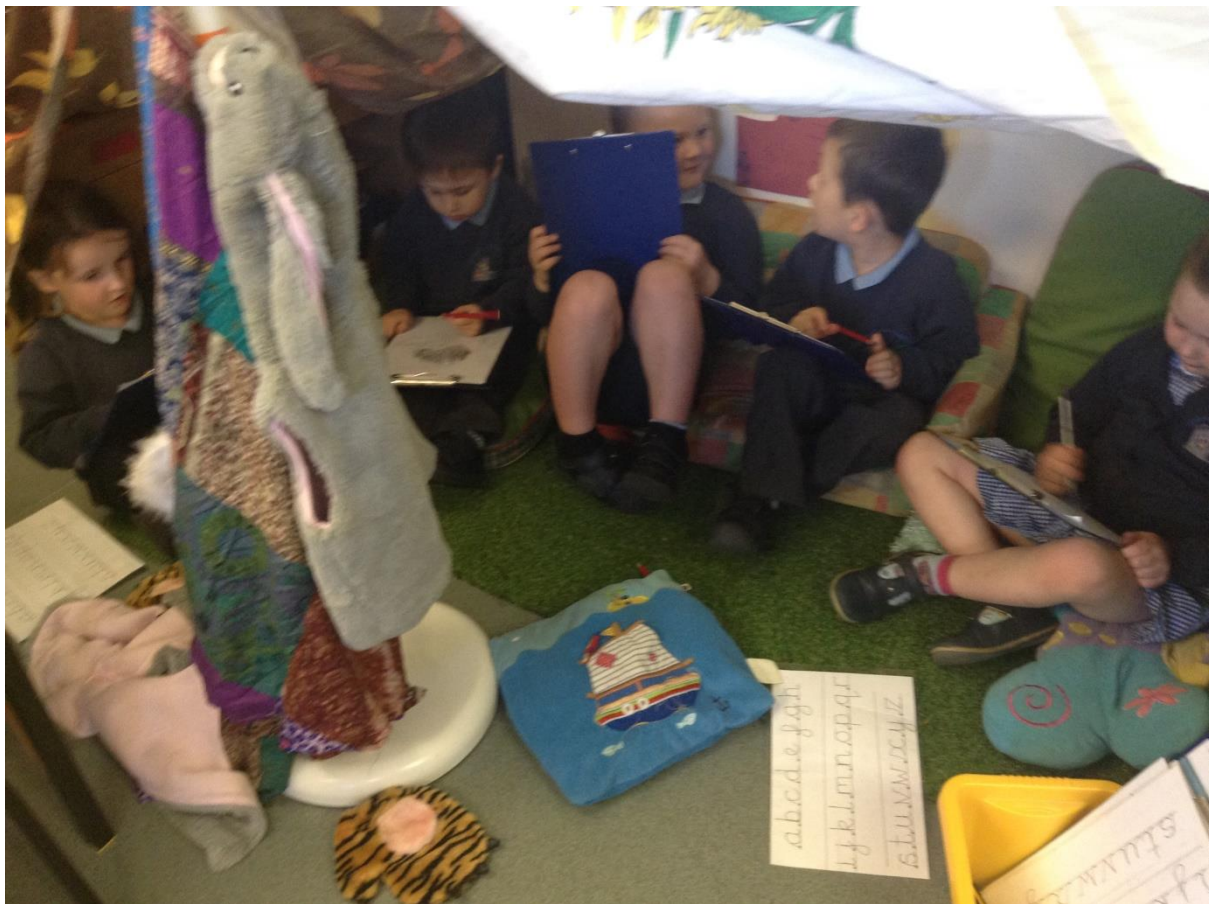
Writing stories in our forest den.

Our phonics is coming along well and we are using lots of sounds in our writing and reading. All our children love stories and it is hard to read all the books they select for story time during each day.