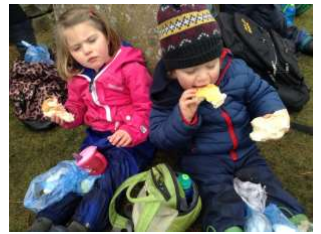
We were ready for our lunch, and even had second lunch when we got back to school!