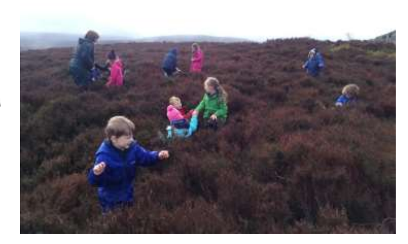
Where we had great fun in the heather.