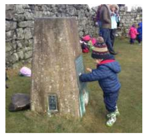
But finally we reached the summit!