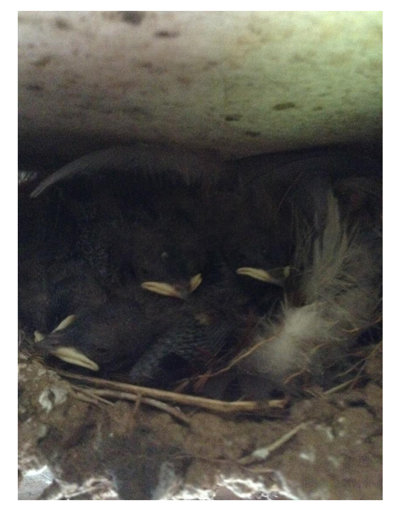
To fluffy, noisy and very cheeky babies who are permanently hungry!