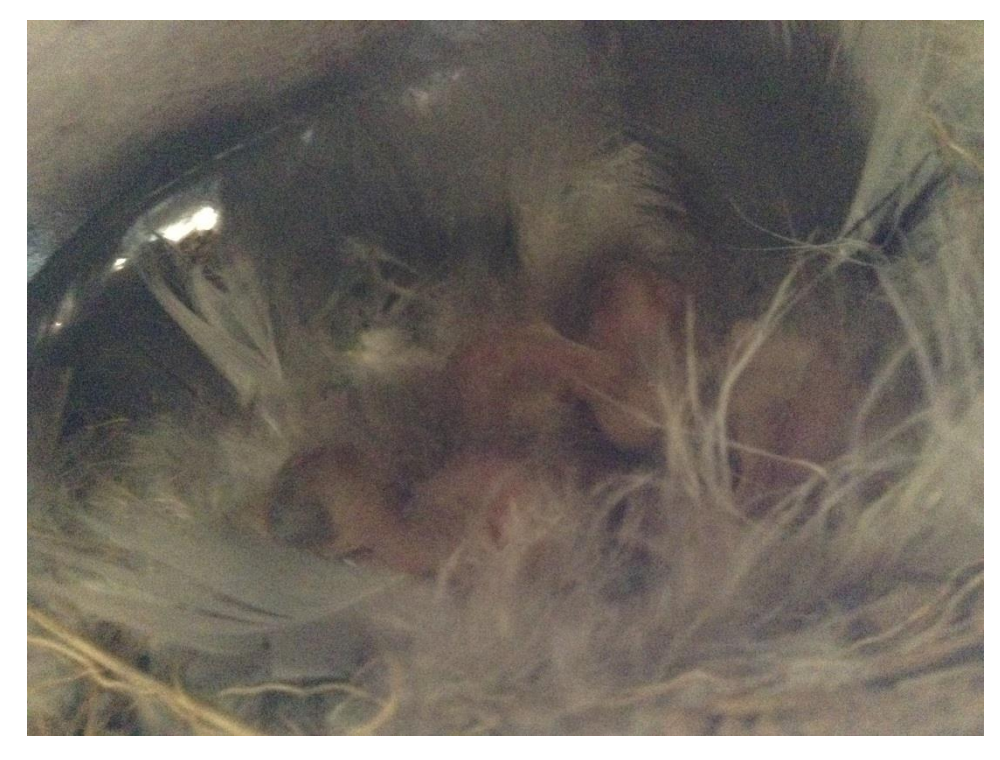
In one week they have changed from these strange looking little creatures....

Summer is here despite the changeable weather and we have enjoyed watching plants in our garden finally start to grow. We have also watched some of the creatures around our school grow. Although our swallow's nest is quite high up they are very patient when we photograph their babies with the iPad to see how much they have changed.